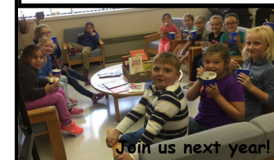
Join us next year!