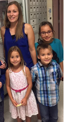
H & S President and her children.

A sincere and heartfelt thank-you is extended to the hundreds of parents, children, and staff members who attended RES's 2017 Open House & Ice-Cream Social on Thursday, September 20th!