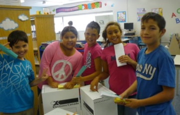
Eager RES students vote for RES' 2012-2013 Student Council Executive,