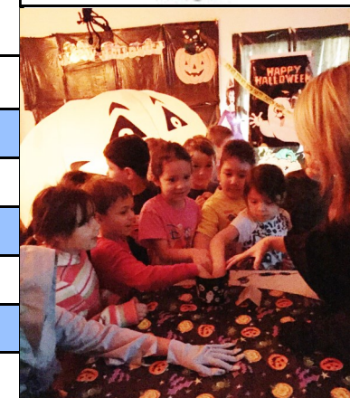
RES Starfish exploring tactile activities in our Student Council Haunted class on Friday, Oct. 30th.