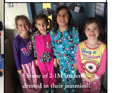
Some of 2-1M students dressed in their jammies!!

As required by law under the Public Health Act and the Education Act, children entering school in New Brunswick must provide satisfactory proof of immunization. A public health nurse assigned to our school reviews our student's records to ensure that all required vaccines have been administered. Call Public Health @ 523-7606 for information.