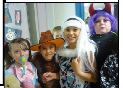
Scary 45 Students!

REMINDER: There is to be NO nut products (peanuts, nuts, almonds, etc.) at RES ... even during our November 16th Tea & Craft Sale.