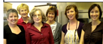
RES staff members and former parents of RES students, volunteered in Santa's Café during last year's Tea & Craft Sale. It takes a village to raise ... funds at RES' annual Tea & Craft Sale!!