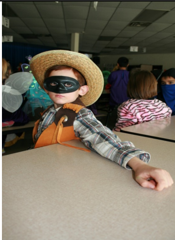
Who is this masked-man?