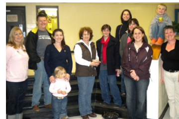
Pictured above are just some of RES' 2009 parent volunteers who were instrumental in making last year's Tea & Craft Sale a roaring success!