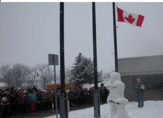
RES students and staff pause on Feb. 15th for our Flag Raising Ceremony to mark national Flag Day.

RES' staff will continue to ensure that their classroom windows are opened at least twice a day to allow a flow of fresh air to ribbon through our classes and corridors. Further information on Radon is available on the New Brunswick Department of Health website at http://www.gnb.ca/0053/radon/index-e.asp .