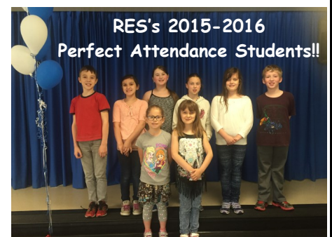
RES's 2015-2016 Perfect Attendance Students!!

Parents of next year's grade 1 & grade 2 students who want more information about this wonderful opportunity are asked to please call RES @ 523-7152.