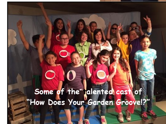
Some of the talented cast of "How Does Your Garden Groove!"