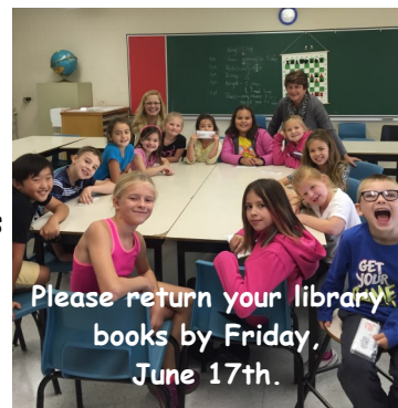
Please return your library books by Friday, June 17th.

Once the class lists have been read and the students have been introduced to their new teachers, then the teachers will lead their new students to their classrooms.