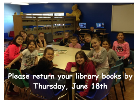
Please return your library books by Thursday, June 18th

5). On the first day of school, our Grades 1-5 students will enter our school building and go straight to our school cafeteria. Once the class lists have been read and the students have been introduced to their new teachers, then the teachers will lead their new students to their classrooms.