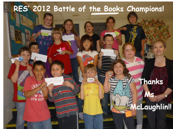
Thanks Ms. McLaughlin!!

We wish you all a safe & happy summer vacation ... see you in September!