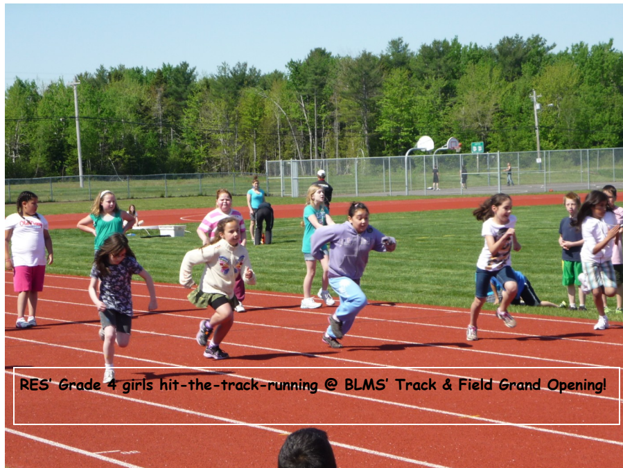
RES' Grade 4 girls hit-the-track-running @ BLMS' Track & Field Grand Opening!