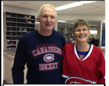
Jersey Day with RES' Montreal Canadienne fans?!