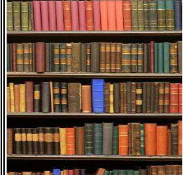
90 th percentile