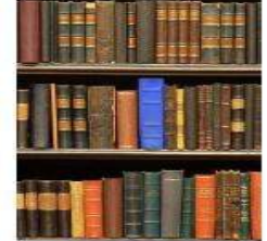
50 th percentile