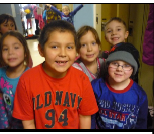
1C cuties dressed in their PJs on Friday, January 31st!