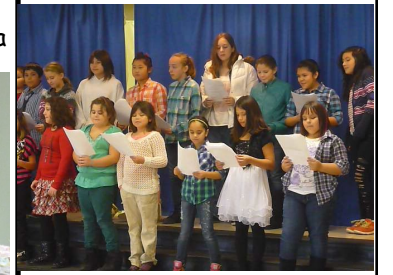
RES' 2013 Christmas Choir performing at this year's Christmas Tea & Craft Sale