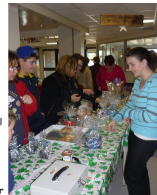
Shoppers scan our Bake Sale table for some tasty goodies!

We also want to thank RES' custodial and teaching staff for taking time out of their busy schedules to help make this year's event a gigantic success!!