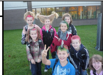
RES' Students go crazy on Crazy Hair Day!!