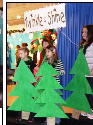
Pictured above and below are some of the cast members from RES' Twinkle & Shine musical.

76% of our students' parents attended RES' November 2012 Parent/Teacher Meetings to discuss their child's progress with their child's teacher.