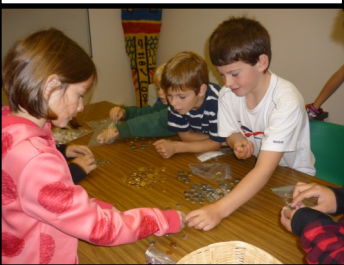
Pictured above are RES' Student Council members counting the funds raised through this year's Crazy Hair Day event.