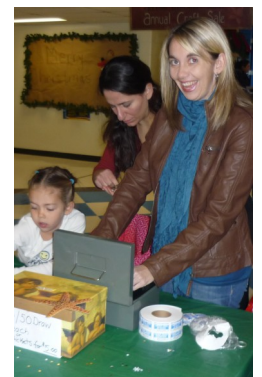
Pictured above are a few of RES' Tea & Craft Sale volunteer greeters!