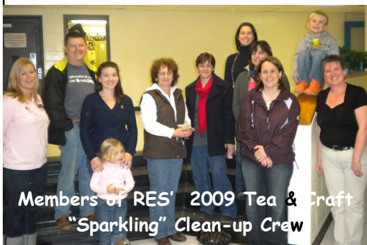
Members of RES' 2009 Tea & Craft "Sparkling" Clean-up Crew

Then the shoppers scurried to our school gymnasium to browse through our artisan's treasures.