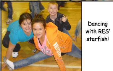
Dancing with RES' starfish!