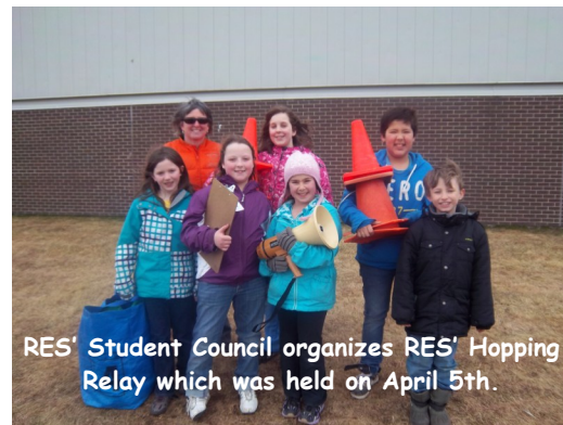
RES' Student Council organizes RES' Hopping Relay which was held on April 5th.

For your information, we are currently accepting your orders for RES' 2012 School Yearbook. Please check-out RES' website ( http://www.rextonelementary.nbed.nb.ca/ ) to read our student's writing!