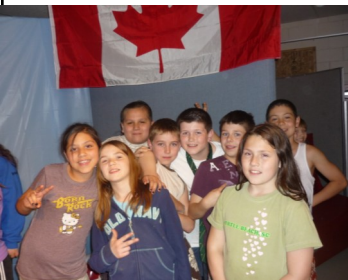
Some of the cast members for RES' "I Need a Vacation" Play

We're on the Web @ http://rextonelementary.nbed.nb.ca/