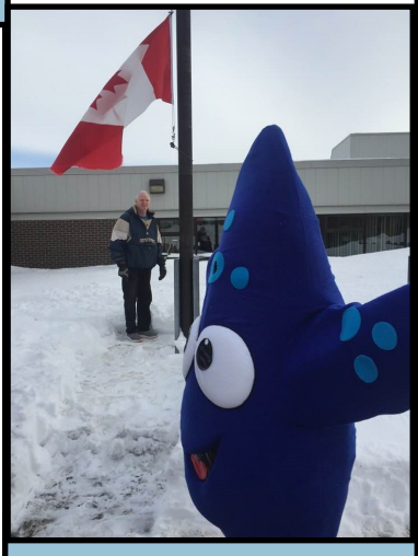
ASDN's Support Staff Award

ASD-N's "Students First Award", is intended to acknowledge the significant contribution non-teaching support staff make to the students of our district.