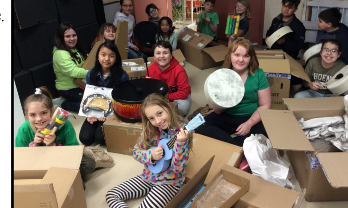
Featured in the photo above are 5B students as they opened up our Ukuleles and drums!

Much of the funding from this grant went towards purchasing a new sound system for our school but we also purchase new instruments such as ukuleles and drums!