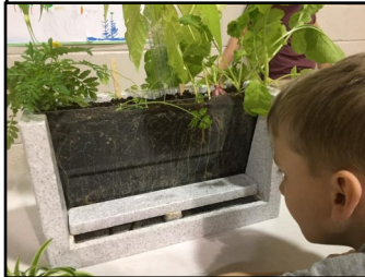
Photos from RES's 2018 STREAM Fair