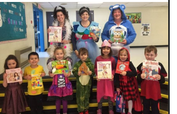
KB loves to dress-up & READ!