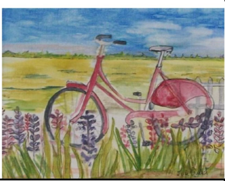
Luce Audet (Shippagan) Parmi les fleurs, 2014